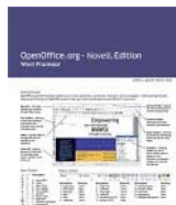
OpenOffice.org Word Processor Quick Start Card BrainStorm Editors Amazon Price: $4.95