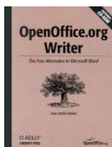
OpenOffice.org Writer: The Free Alternative to Microsoft Word Jean Hollis Weber Amazon Price: $18.96