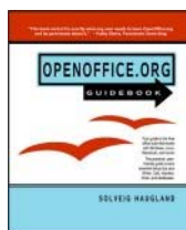
The OpenOffice.org 2 Guidebook Solveig Haugland Amazon Price: $59.99